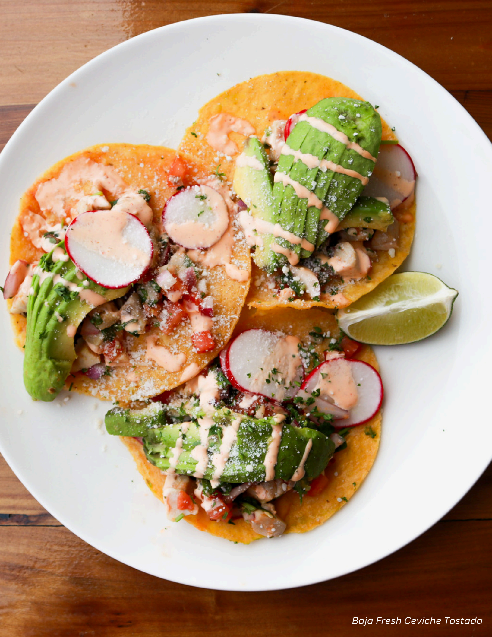
Baja Fresh Ceviche Tostada