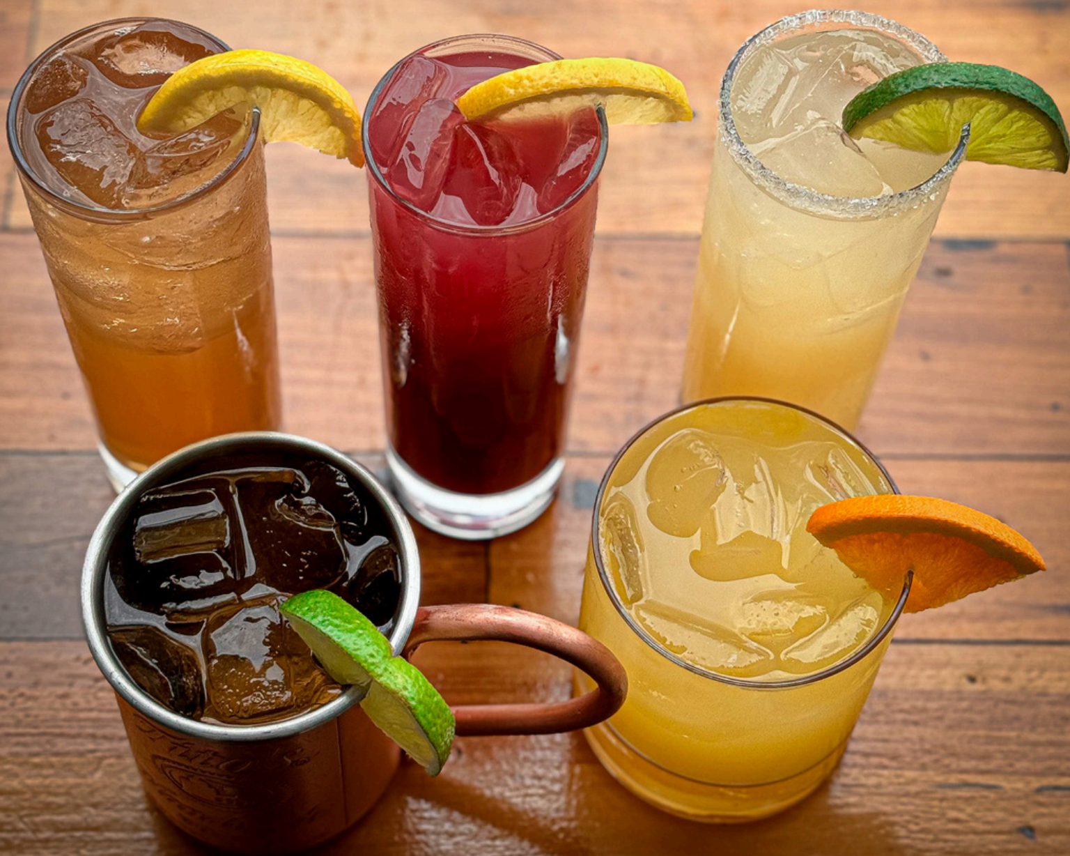
(From left to right) 19th Hole | Dragonfly | Margarita | Mule | Orange Crsuh